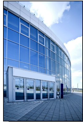
Facilities Information Management System